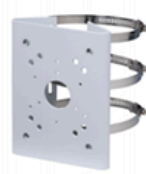
A36 Pole Mount